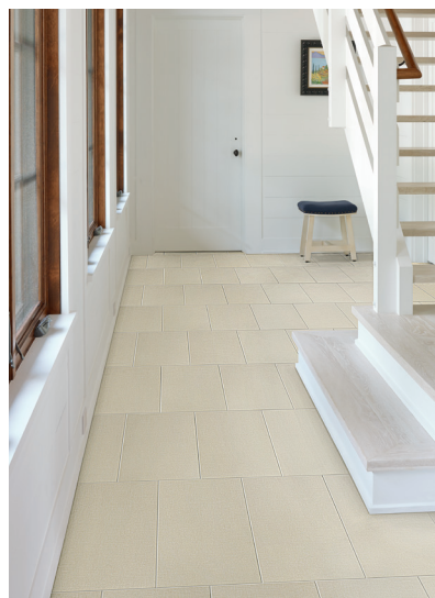
Cotton 12 x 24