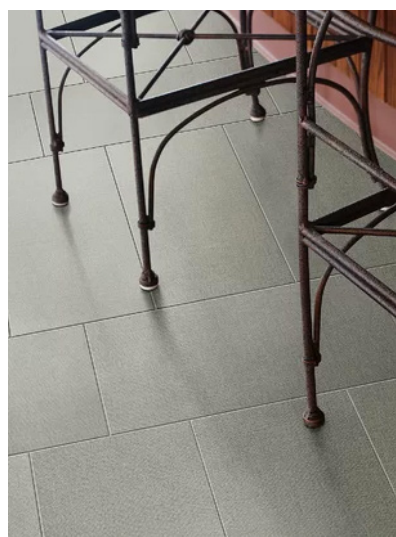
Flannel 12 x 24