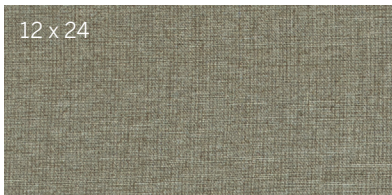
12 x 24