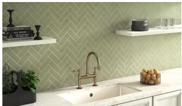
Grass 2 x 6